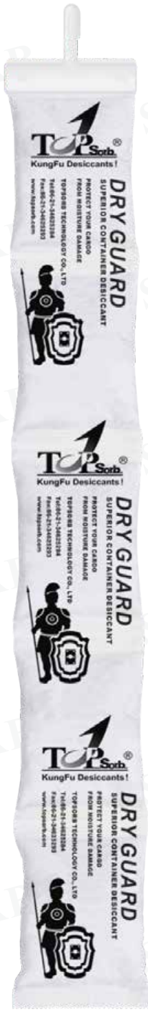
Dry Guard S-1000g