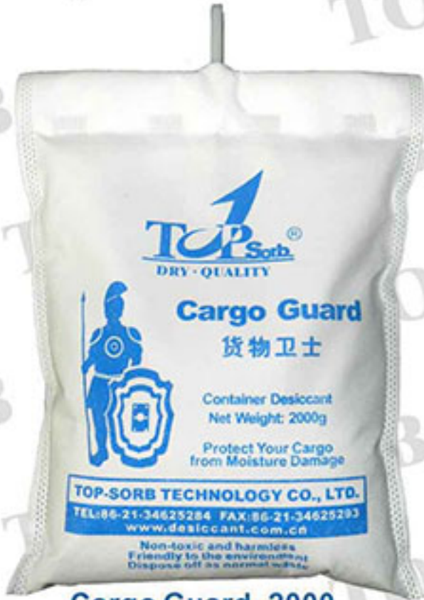
Cargo Guard -2000 (with hook)

For containerized cargo damp problems, we provide a solution, TOP-SORB series container desiccants, which create a dry environment in the container. It can effectively adsorb humidity, and control "dew point" temperature below the actual temperature, and thus prevent mildew, rust formation.