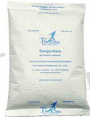
Cargo Care -500