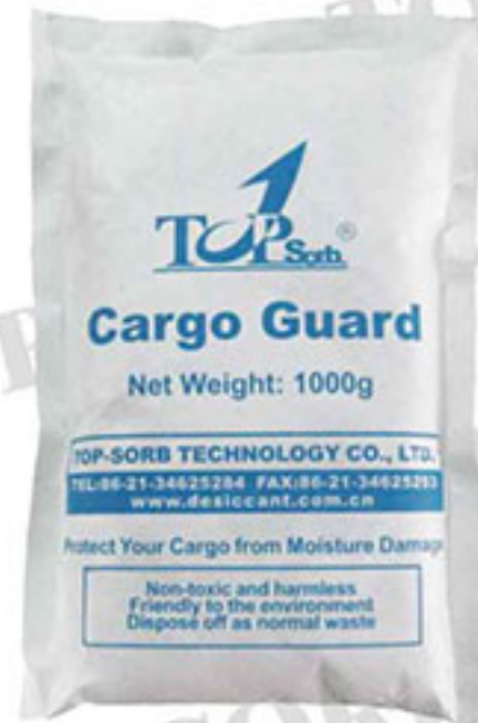
Cargo Guard -1000