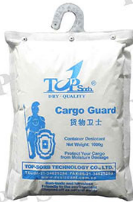
Cargo Guard -1000 (with hook)